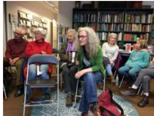
Book readings at New Chapter Books, April 2023 during Wigtown Booksellers Spring Weekend were well attended.