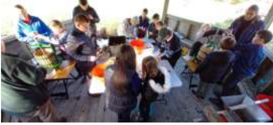
Apple Day at Glenluce Primary School, October 2022. We were supported by Galloway & Southern Ayrshire UNESCO Biosphere and local woodland volunteers.