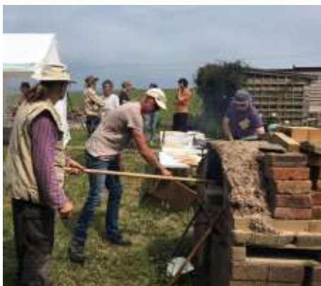
Our first online climate conversation with Kenyan farmers, February 2023. Thinking global, acting local!