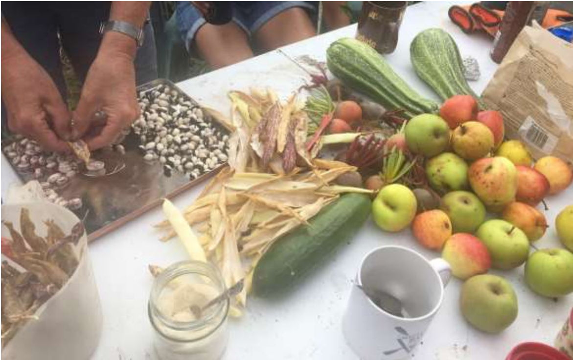
Harvesting local seed and produce at MAC-CAN Croft.

We love to share information and stories about activities happening in and around the area, promoting those organisations and events that best serve our community in tackling different aspects of the climate and ecological crises. Volunteers in the communications group identify relevant national and local initiatives which we promote via social media to a growing network of over 400 followers.