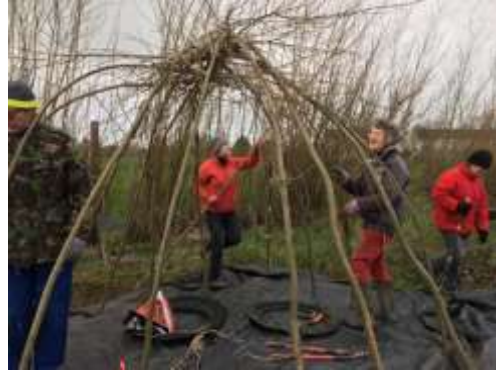
Winter work at MAC-CAN Croft, December 2022. The willow dome was constructed using materials from our onsite willow hedge.