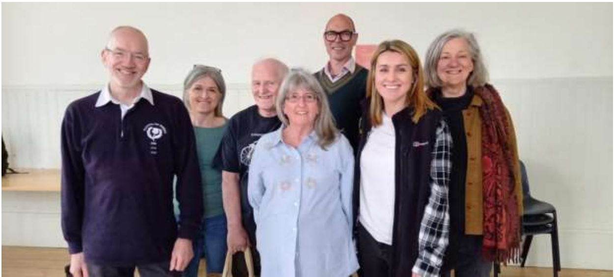
Some of those involved in MAC-CAN core group