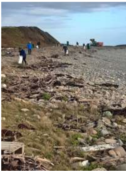
Big beach clean at the remote Carleton shore on Luce Bay, October 2022. The beach cannot be cleaned frequently because of its inaccessibility. Working with Solway Firth Partnership is key to delivering our trickier beach cleans.