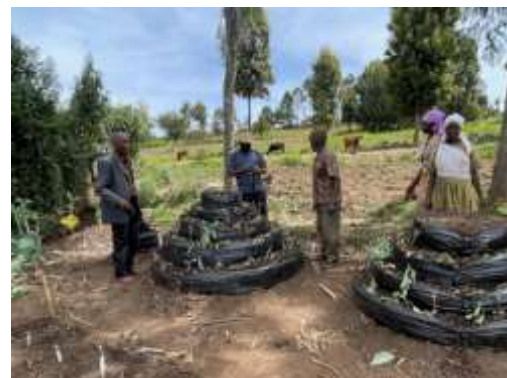
Vertical gardening. Kenyan farmers making good use of limited water and soil resources in a deforested environment.